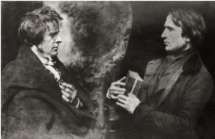
Composite photograph of Hill (left) and Adamson, both circa 1845

THEIR WORK CAN BE SEEN AT THE NATIONAL PORTRAIT GALLERY ON