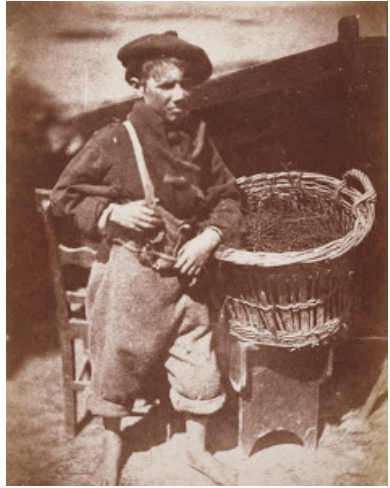
His Faither's Breeks Newhaven Harbour