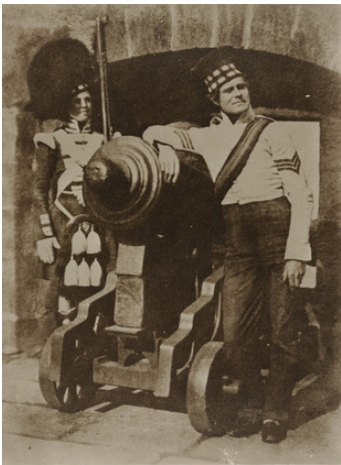
Gordon Highlanders at Edinburgh Castle April 9 ,1846