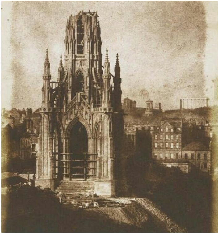
The Scott Monument during construction,

Edinburgh , 1844 ROBERT ADAMSON (1821 - 1848)